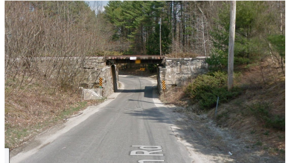
Berlin Sub-Division Bridge in Pownal