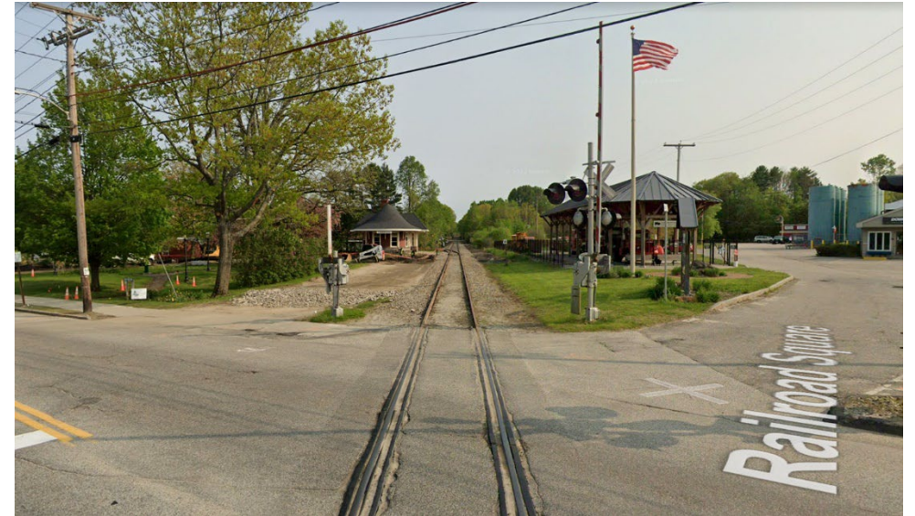
Berlin Sub-Division Corridor in Yarmouth